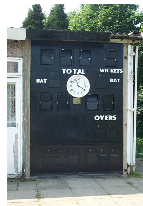
The New Scorebox