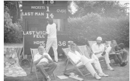
The Old Scorebox

CHRISTMAS EVE 1976 saw the opening of the new clubhouse at Hadley Field which followed the most concerted effort from the club members that there has ever been or likely to be.