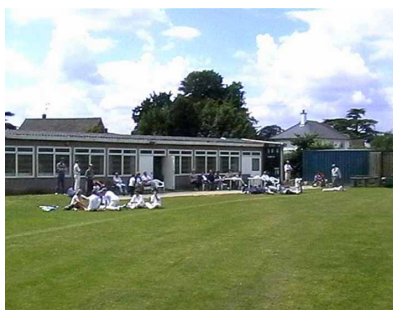
The New Clubhouse