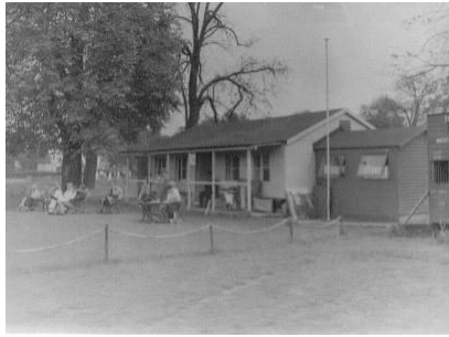
The Old Clubhouse