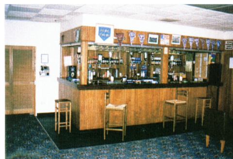
The New Bar