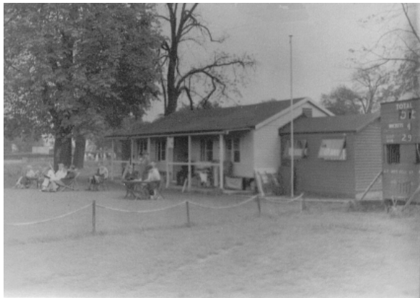
The Old Pavilion

Finally, in 1950, the new ground and club headquarters was established and an old wooden pavilion was transferred from a nearby ground in Firs Lane, Winchmore Hill. The ground itself was not ready for the start of the season and so cricket on Hadley Field started on 24th June 1950 with the game against Old Owens . . . . . and the rest, as they say, is history!