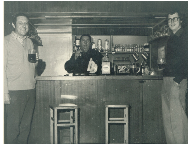
The Old Bar